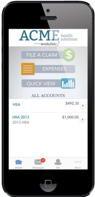
Above: With the convenience of a mobile device, you can see your available balance anywhere, anytime as well as file claims and upload receipts.

*The amount you save in taxes with a Flexible Spending Account will vary depending on the amount you set aside in the account; your annual earnings; whether or not you pay Social Security taxes; the number of exemptions and deductions you claim on your tax return; your tax bracket and your state and local tax regulations. Check with your tax advisor for information on how participation will affect your tax savings.